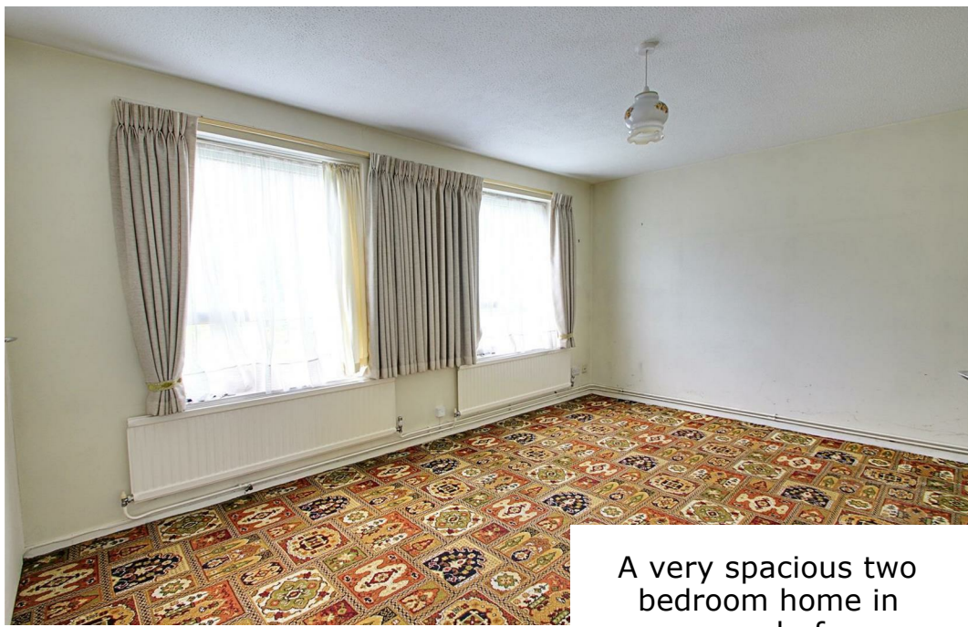
A very spacious two bedroom home in need of modernisation.